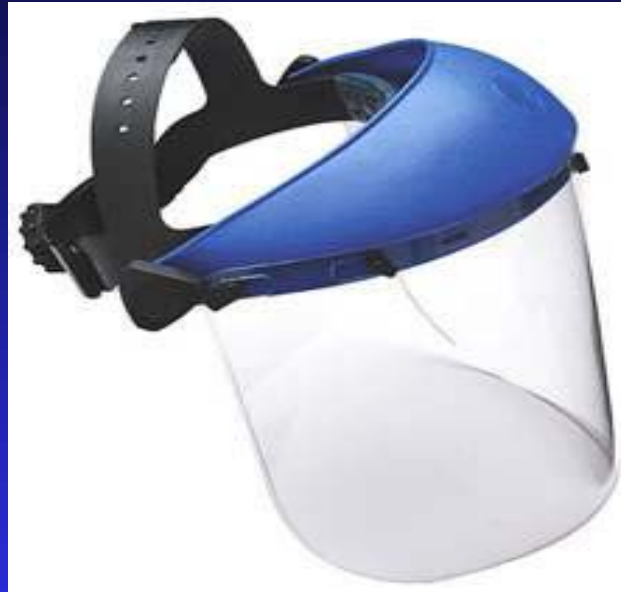
Lab Safety Supply Inc. Faceshield

–All faceshield windows are to be marked with the manufacturer's mark, Z87, and a + sign.